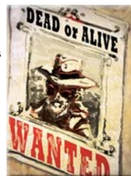
Wanted Posters from the original Blood Bowl League.

The question stands should there be bounties in the league, do we not find it barbaric well the Fractured